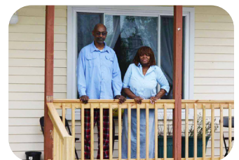
OLDER ADULT HOME MODIFICATION PROGRAM