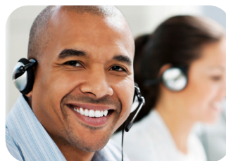
2-1-1 LONG ISLAND