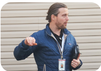
WORKFORCE DEVELOPMENT TRAINING ACADEMY

2-1-1 Long Island non-emergency call center 24/7/365 days of the year connects people in need to local health and human service agencies.