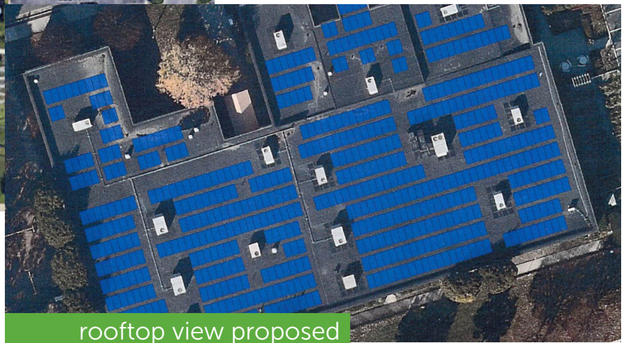
rooftop view proposed