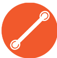
Accessibility & Grab Bars