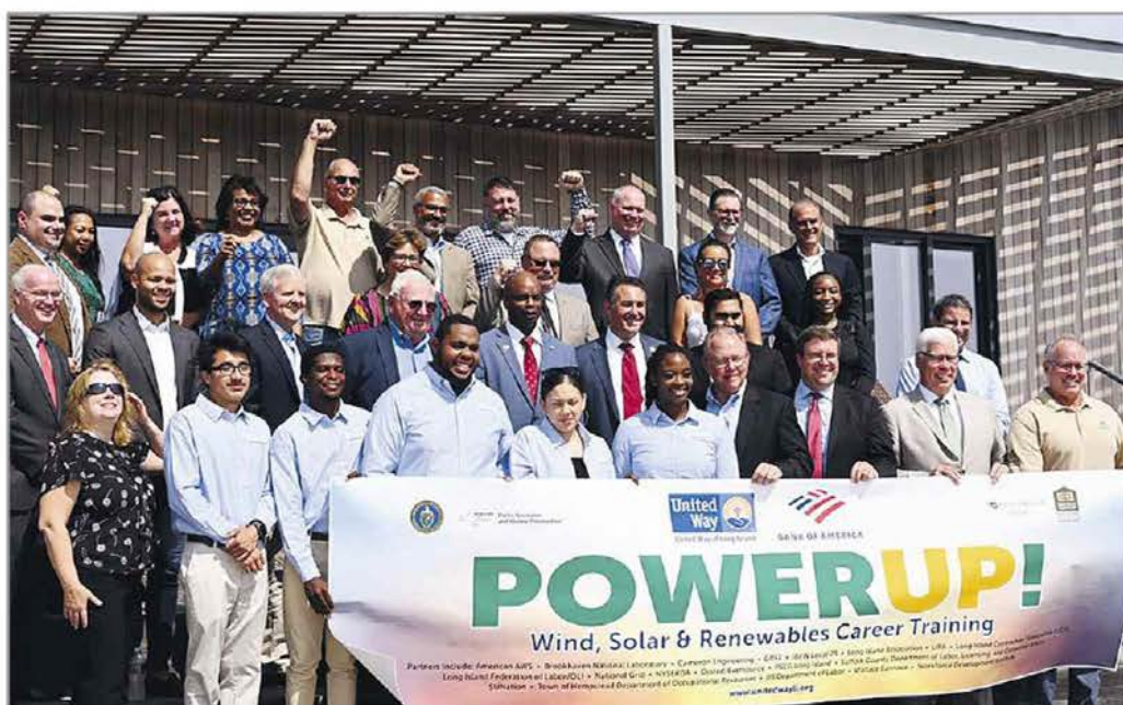
United Way Long Island board members, trainees and local officials gather at the Jones Beach Energy and Nature Center on Tuesday to announce the new green-energy training program.

Called Power Up Wind, Solar & Renewables, the training will take place at United Way's Deer Park E3 SmartBuild Training Center and the Jones Beach Energy and Nature Center. The program is designed to "advance economic mobility as