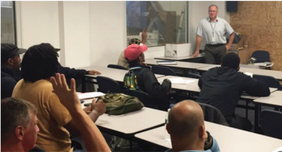
The United Way of Long Island training center.

By: David Winzelberg " September 1, 2021