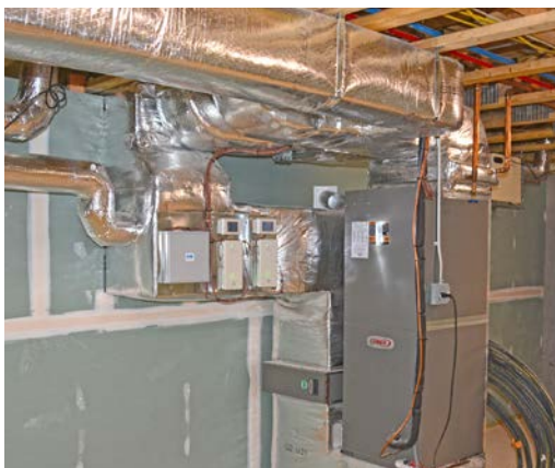
Space and water heating are both provided by a high-efficiency, wall-mounted, gas-fired boiler.

Despite the corner-lot orientation limitations, space was planned on the south-facing roofs for a 6.9-kW PV panel array. “The PV system should offset the home’s connected loads, resulting in no electric bills, under normal use,” said Wertheim. With the solar panels, the home is expected to reduce energy costs by about $2,500 compared to a similar sized home built to the 2009 International Energy Conservation Code.