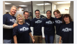
Suffolk Transportation Service/ Suffolk Bus Co.