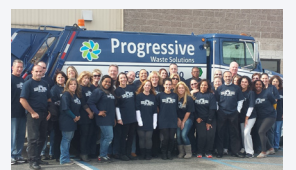
Progressive Waste Solutions of LI, Inc.