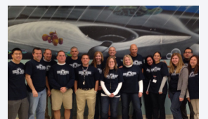
Bellmore Merrick Secondary Teachers Association