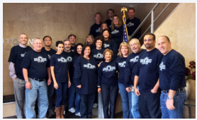
Interboro Auto One Insurance