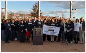
Town of Brookhaven