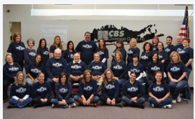
CBS Coverage Group