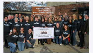
Suffolk County Government -Dept. of Labor