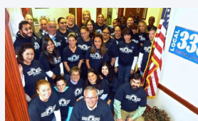
Local 338 Retail, Wholesale and Department Store Union